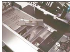
Shown is spring loaded and self adjusting, transport deck plates with vacuum (transport belt removed for detailed view).