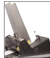
Optional Feeder: Add a Secap Friction Feeder for consistent delivery of media.