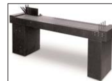
Optional Conveyor: Add a conveyor for improved drying and convenient stacking of materials.