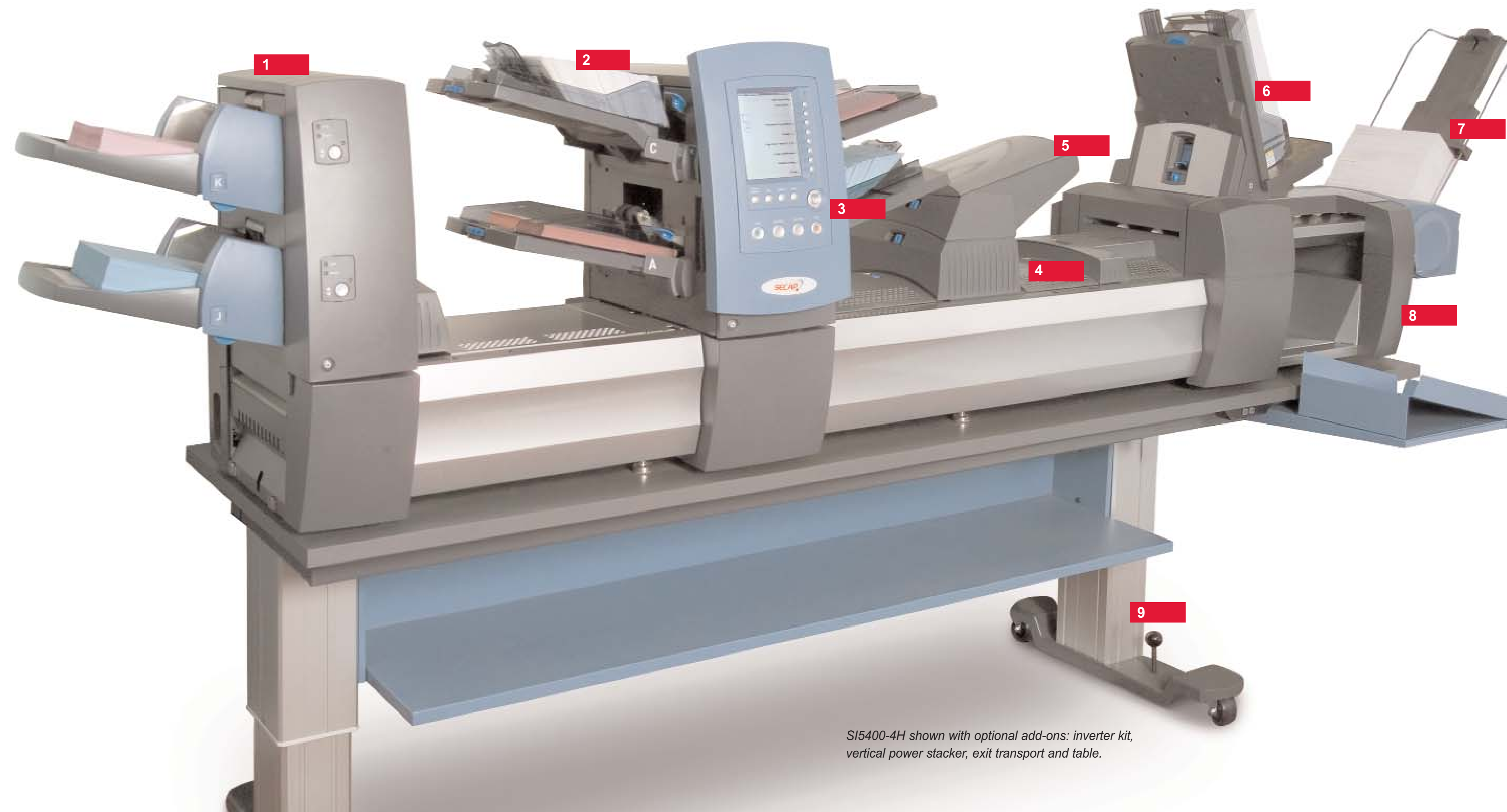
SI5400-4H shown with optional add-ons: inverter kit, vertical power stacker, exit transport and table.

Ask your mailing specialist about adding the optional components 1, 5-9 to suit your individual needs.