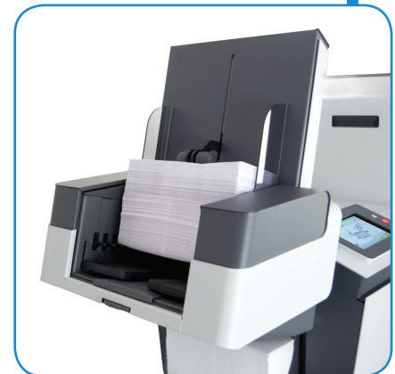
High-Capacity Vertical Stacker holds up to 500 filled envelopes