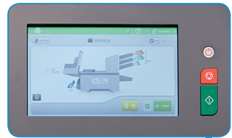
Full-color 7" touchscreen control panel with graphical interface and paper /envelope presence sensors

* Paper & envelope specifications may vary. All media must be tested.