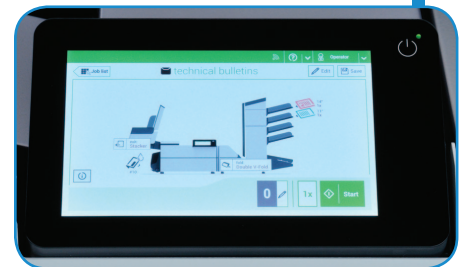
Color Touchscreen Control Panel with graphical interface