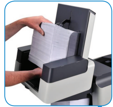
High-Capacity Vertical Output Stacker