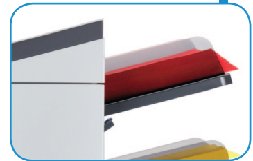
High-Capacity Document Feeder