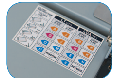
Clearly marked fold guide for quick and easy setup

The FD 300 Office Desktop Folder provides an economical solution for low-volume folding projects. This compact folder processes 11" and 14" paper at speeds up to 7,400 sheets per hour, and is clearly marked for 4 common fold settings.