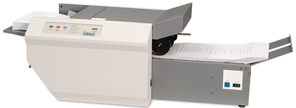
Shown with optional 18" conveyor

The FD 2032 AutoSeal ® desktop pressure sealer provides a reliable and compact solution for processing pressure sensitive self-mailers. Up to 350 forms can be loaded in the hopper and processed at speeds up to 11,000 forms per hour.