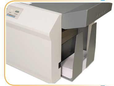
Standard Catch Tray

The FD 2032 processes forms at a rate of up to 11,000 sheets per hour and can hold up to 350 - 24# forms in the feed hopper. This makes the FD 2032 an economical and reliable solution for high-volume processing in a compact tabletop model.