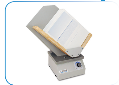
402 Series Jogger - an option which reduces static electricity from forms and aligns them for proper feeding